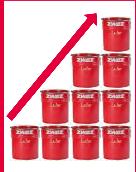
Continuous growing market share of ZWEZ-Lube